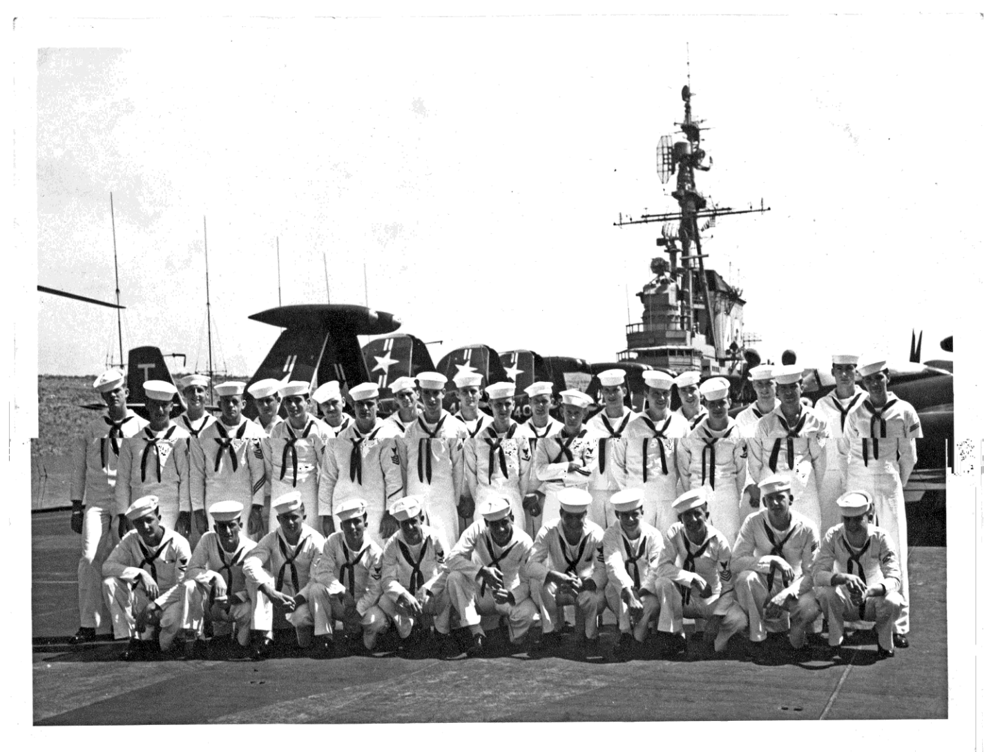
Enlisted men of VF-12 which was taken in the summer of 1951 aboard the USS Coral Sea when we were on a 6th Fleet cruise in the Mediterranean Sea. Unfortunately, I did not write down the names of the people in the photo. I am in the back row second from the left.